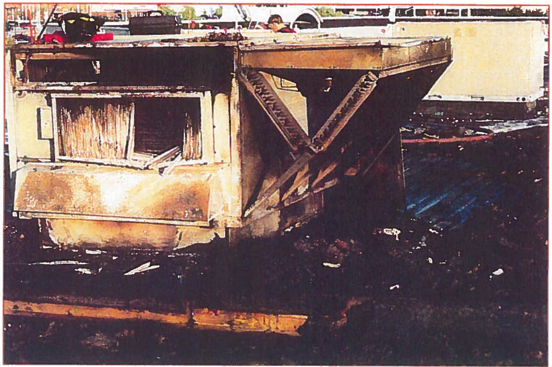
HVAC equipment on the roof of the mall destroyed by the fire.