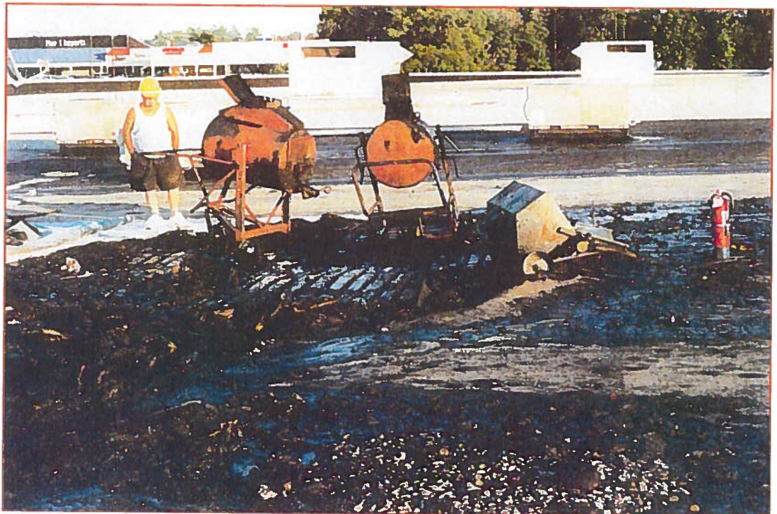
This fire at a large mall in the Southeast started as the result of spontaneous combustion of a roofing mop used earlier in the day.

Conventional built-up roof (BUR) assemblies have lost market share in recent decades to other roofing options. While BUR can provide years of dependable service at a competitive price, concerns regarding the use of hot asphalt have been expressed by building owners and insurance companies with primary concerns regarding fumes and fire. One particular cause of fire is the spontaneous combustion of roofers' mops. A recent case involving this phenomenon revealed the absence of readily available information. This article is intended to provide a summary of the basics that are important to understanding this phenomenon, the information available, and recommended steps to avoid such an incident.